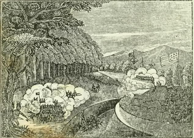
GALLANT DEFENCE OF FORT SANDUSKY, BY MAJOR CROGHAN